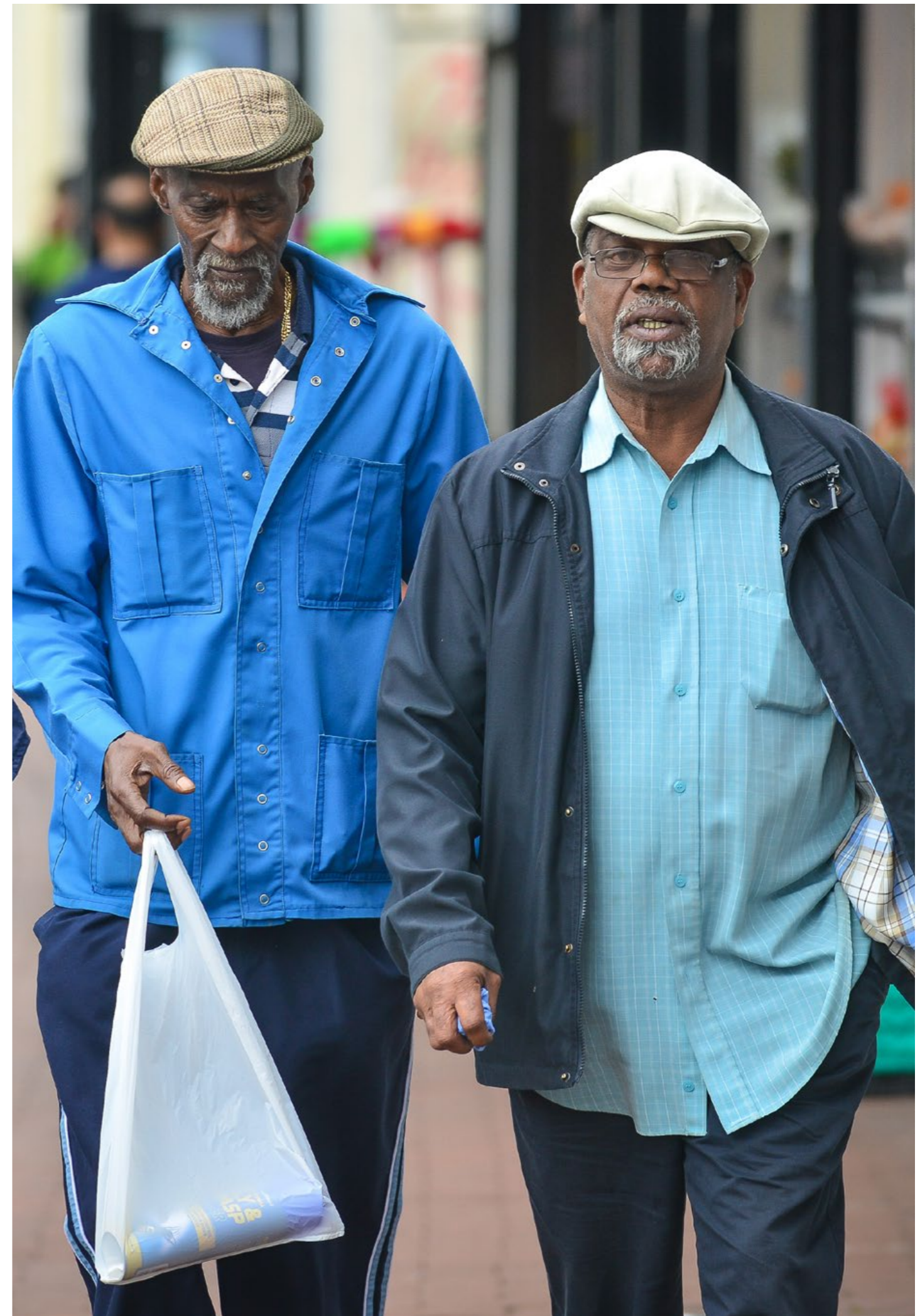
A summary for local people

We all have to think responsibly about how we use services, and how we organise services to meet the needs of our population.